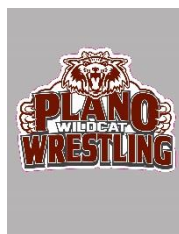
Car Decal $7