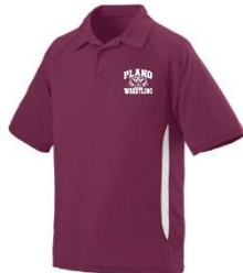
Men's Polo $29