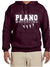
Hoodie 30$ 3 Color Options