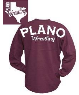
Ladies Billboard Jersey $40