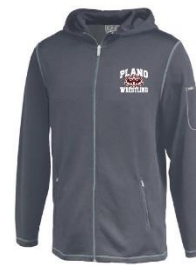
Mid Wt Zip $44