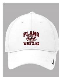
Nike Cap $30