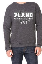
Drop Shoulder Sweatshirt $35