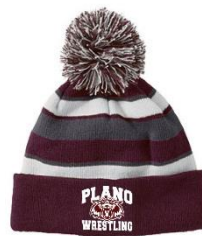
Pom Beanie $24