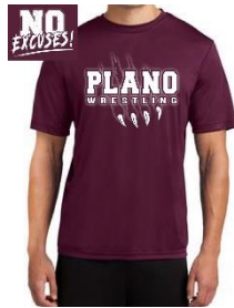
Performance Tee $21 3 Color Options