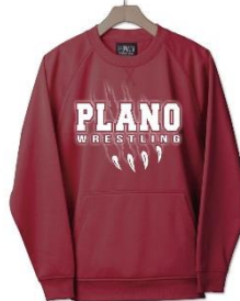
Pocket Sweatshirt $36 3 Color Options