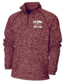
Vintage 1/4 Zip $38