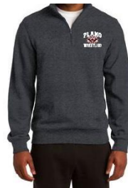
Men's 1/4 Zip $39