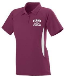
Ladies Polo $29