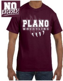
Cotton Tee $17 3 Color Options