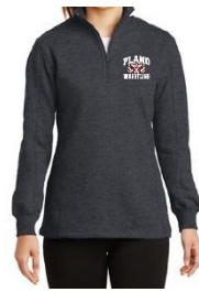
Ladies 1/4 Zip $39